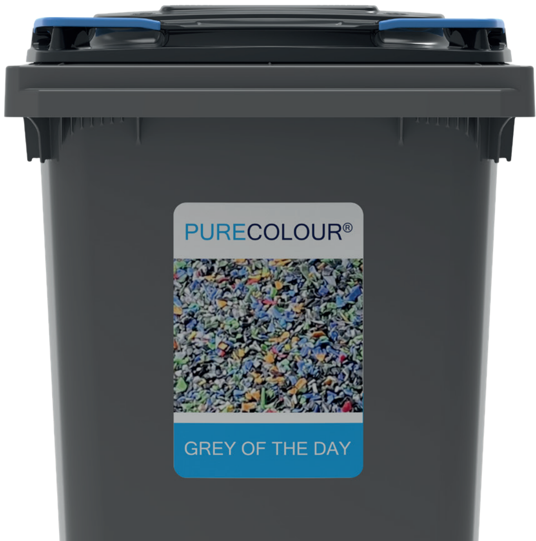
240 L CL bin with PURECOLOUR® Code FC 930

Every time the plastics come back for reuse, more colour additives are added to reach strict colour requirements. This will compromise a PURE plastic lifecycle.